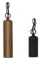
Hanging Light 5 Speckle Hanging Light 5.

Transform your alfresco space or walkway with a high-quality illumination.