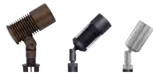
Accent 11, 8 and 5.

Quality up-lighting available in a range of finishes. Riser and Hood accessories also available.