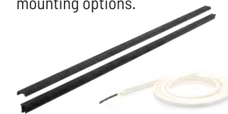
Series 2 Mounting Profile 1m and 2m, Neon Side Flex 1m, 3m, 5m, 10m and 15m.

A flexible end-to-end, dot-free continuous ribbon of light, with black S2 Mounting Profile accessory featuring universal mounting options.