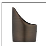
ACCENT 11 HOOD BZE

The following fittings are also available in the Accent Lights Accessories range.