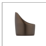
ACCENT 8 HOOD BZE