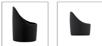
ACCENT 11 HOOD BLK

The following fittings are also available in the Accent Lights Accessories range.