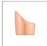
ACCENT 8 HOOD COP

The following fittings are also available in the Accent Lights Accessories range.