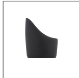
ACCENT 5 HOOD BLK

The following fittings are also available in the Accent Lights Accessories range.