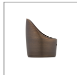
ACCENT 5 HOOD BZE

The following fittings are also available in the Accent Lights Accessories range.