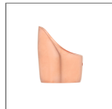
ACCENT 5 HOOD COP

The following fittings are also available in the Accent Lights Accessories range.