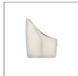
ACCENT 5 HOOD NKL

The following fittings are also available in the Accent Lights Accessories range.