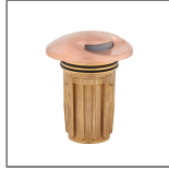
INGROUND PATH LIGHT 90D COP

The following fittings are also available in the Inground Path Lights range.