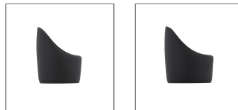
ACCENT 5 HOOD BLK

The following fittings are also available in the Accent Lights Accessories range.