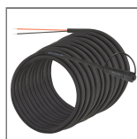
CONNECTOR SERIES 15M FIELD CABLE