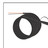
CONNECTOR SERIES 5M FIELD CABLE