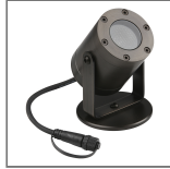
UNDERWATER LIGHT 5 CONNECTOR SERIES BRONZE

The following fittings are also available in the Underwater Lights range.