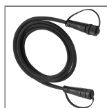
CONNECTOR SERIES 3M EXTENSION