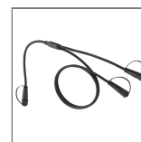
CONNECTOR SERIES 2-WAY JUNCTION