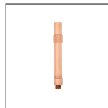
RISER 200 COP

The following fittings are also available in the Accent Lights Accessories range.