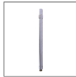
RISER 420 NP

The following fittings are also available in the Accent Lights Accessories range.