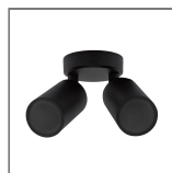
ADJ TWIN WALL LIGHT GU10 BLK

The following fittings are also available in the Wall Lights GU10 range.