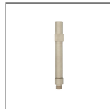
RISER 200 NP

The following fittings are also available in the Accent Lights Accessories range.