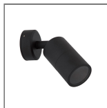
ADJ SINGLE WALL LIGHT GU10 BLK

The following fittings are also available in the Wall Lights GU10 range.