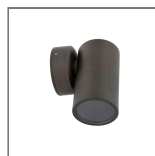
WALL DOWN LIGHT GU10 BZE

The following fittings are also available in the Wall Lights GU10 range.