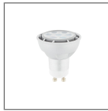
LED GU10 6.5W WARM WHITE

Associated accessories sold separately. Refer to Accessories.