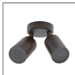
ADJ TWIN WALL LIGHT GU10 BZE

The following fittings are also available in the Wall Lights GU10 range.