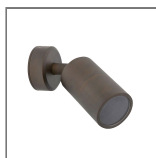
ADJ SINGLE WALL LIGHT GU10 BZE

The following fittings are also available in the Wall Lights GU10 range.