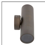
UP/DOWN WALL LIGHT MR16 FB

The following fittings are also available in the Wall Lights MR16 range.