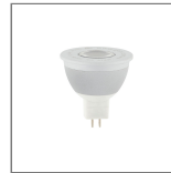
LED MR16 6W WARM WHITE