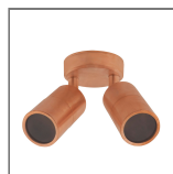
ADJ TWIN WALL LIGHT GU10 COP

The following fittings are also available in the Wall Lights GU10 range.