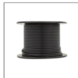
DC CABLE 2.9MM 2 100M

The following items are available to assist with installation and/or warranty compliance.