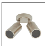
ADJ TWIN WALL LIGHT GU10 NP

The following fittings are also available in the Wall Lights GU10 range.