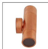
UP/DOWN WALL LIGHT MR16 COP

The following fittings are also available in the Wall Lights MR16 range.