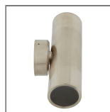
UP/DOWN WALL LIGHT MR16 NP

The following fittings are also available in the Wall Lights MR16 range.