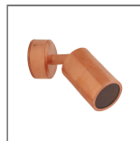
ADJ SINGLE WALL LIGHT MR16 COP

The following fittings are also available in the Wall Lights MR16 range.