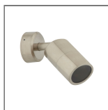
ADJ SINGLE WALL LIGHT MR16 NP

The following fittings are also available in the Wall Lights MR16 range.