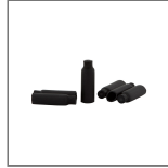
ADHESIVE LINED END CAP 6-2MM 50 PIECES