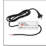
POWER SUPPLY UNIT 60W