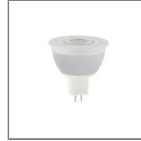
LED MR16 6W WARM WHITE