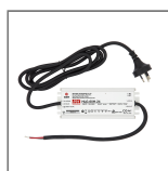
POWER SUPPLY UNIT 60W