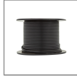
DC CABLE 2.9MM 2 100M

The following items are available to assist with installation and/or warranty compliance.