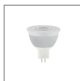
LED MR16 6W WARM WHITE

Associated accessories sold separately. Refer to Accessories.