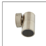
WALL DOWN LIGHT GU10 NP

The following fittings are also available in the Wall Lights GU10 range.