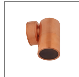
WALL DOWN LIGHT MR16 COP

The following fittings are also available in the Wall Lights MR16 range.