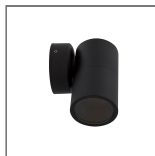
WALL DOWN LIGHT GU10 BLK

The following fittings are also available in the Wall Lights GU10 range.