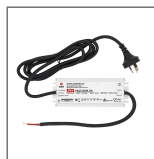
POWER SUPPLY UNIT 60W