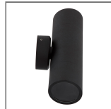
UP/DOWN WALL LIGHT MR16 BLK

The following fittings are also available in the Wall Lights MR16 range.