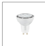
LED GU10 6.5W WARM WHITE

Associated accessories sold separately. Refer to Accessories.