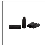
ADHESIVE LINED END CAP 6-2MM 50 PIECES