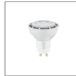
LED GU10 6.5W WARM WHITE