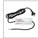
POWER SUPPLY UNIT 60W